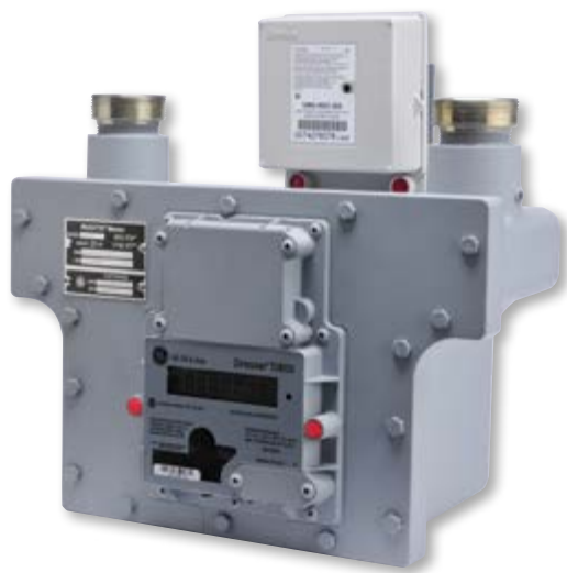
Dresser D800 with Automated Meter Reading (AMR) device installed.