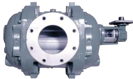
Series B3 23M/36M/56M Meter