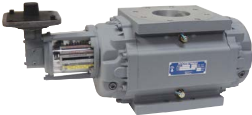
Series B3 7M/11M/16M Meter