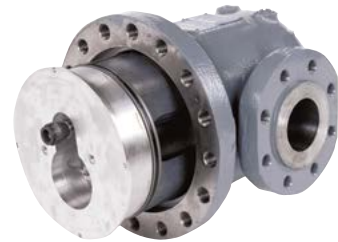
Removable B3-HPC Cartridge