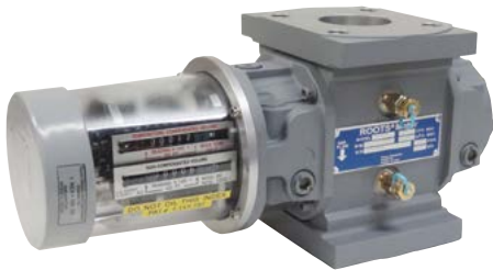
Series B3 8C/11C/15C Meter