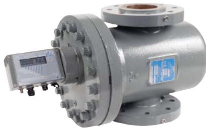
Series B3-HPC with Integral Micro Corrector