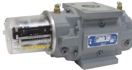
Series B3 2M/3M/5M Meter